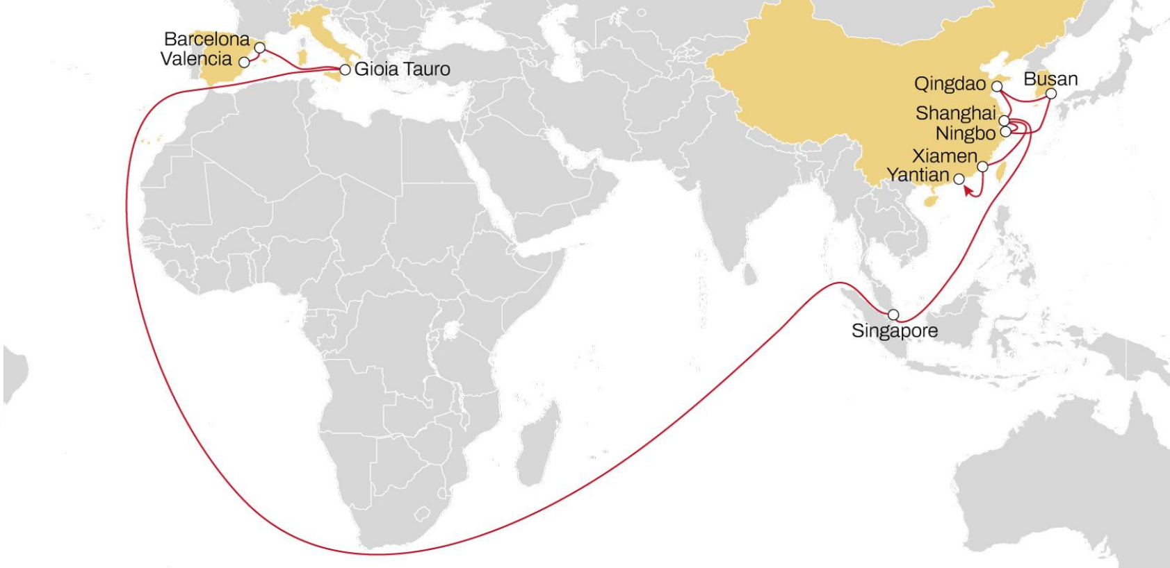
VIA CAPE OF GOOD HOPE