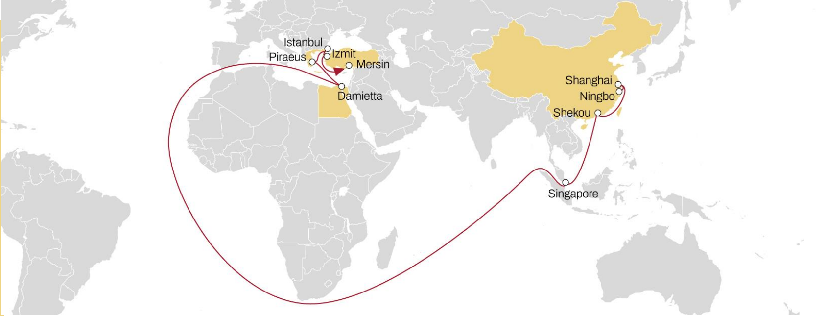
VIA CAPE OF GOOD HOPE