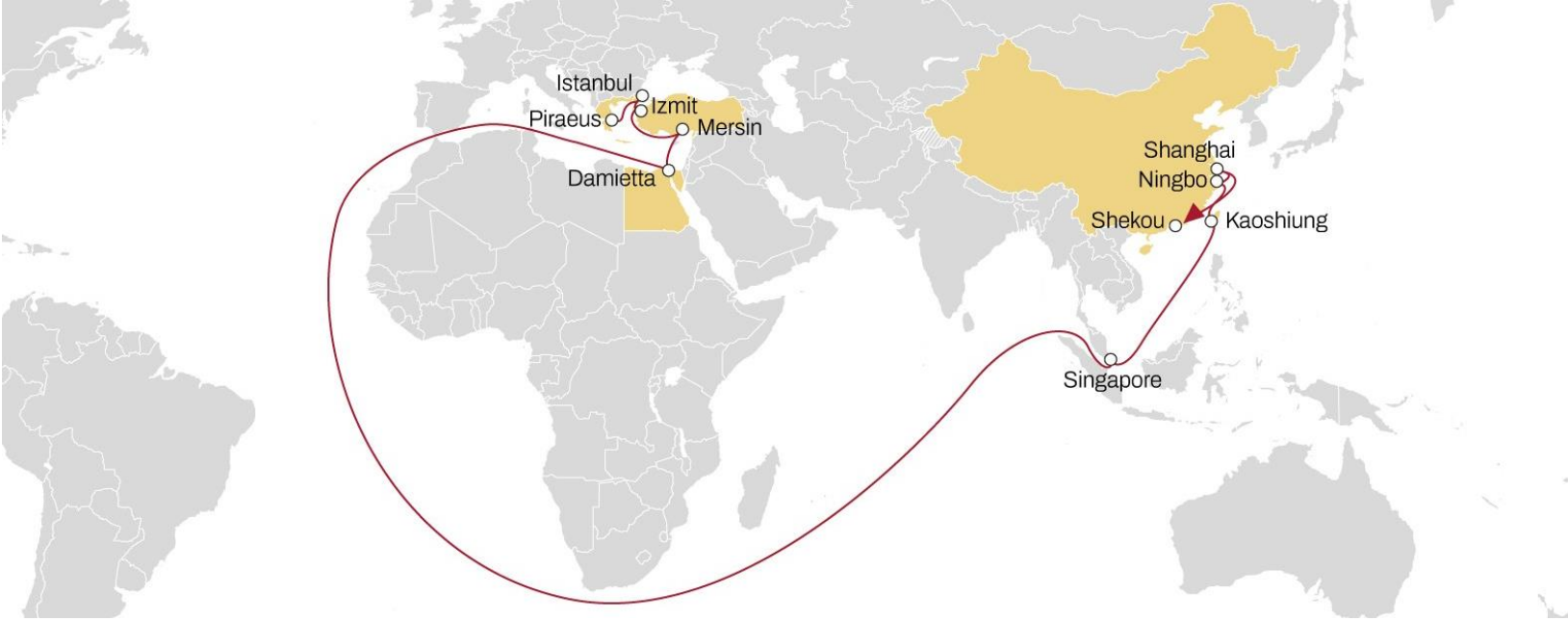
VIA CAPE OF GOOD HOPE