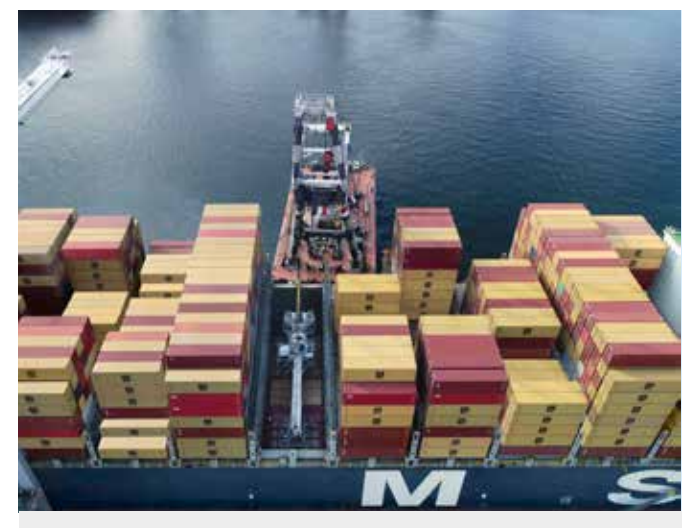
280 tons crane loaded with a floating crane from Europe to Singapore. Dimensions of 33 meters in length, 6.74 meters in width and 12.17 in height.