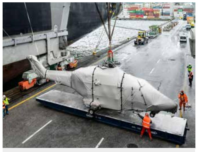
Elicopter shipped from La Spezia to Nhava Sheva with one lifting point: the rotor.