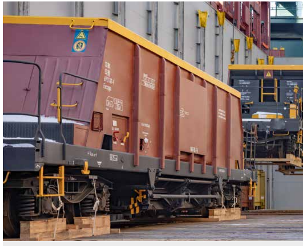
11 rail hopper wagons shipped in the same voyage from Antwerp to Montevideo.

As part of our feasibility studies and preparation, 3D modelling is used to demonstrate handling stowage and lashing requirements